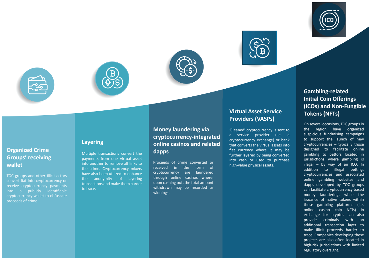
Figure 2: How criminals misuse virtual assets in East and Southeast Asia