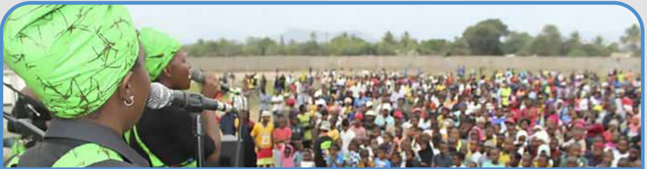
Public awareness campaign on Trafficking in Persons and the Smuggling of Migrants in Malawi (July 2022)