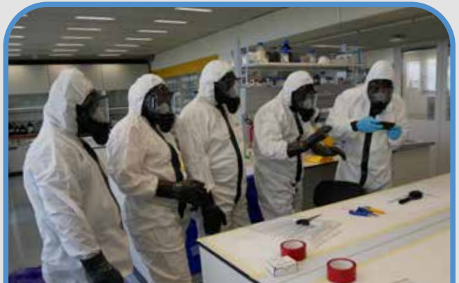
Mozambican law enforcement officials receive training on drug trafficking cases at the UNODC Laboratory in Austria (October 2022)