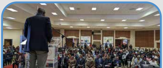
South African Minister of Justice, Mr. Ronald Lamola, speaking at the University of Venda (South Africa) about prison reform, crime prevention and criminal justice (August 2022)