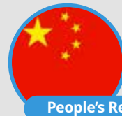
People's Republic of China