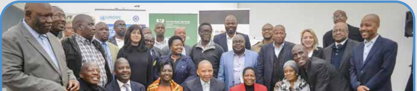
Dialogue on Gender-Based Violence and drug use in rural communities with traditional leaders from the South African province of Limpopo (August 2022)