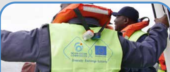
Trainees during a two-week course on maritime security in Namibia (October 2022)