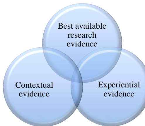
Figure I. Evidence-Based Practice

So-informed, implementation of these efforts can then unfold clear intervention logics and measurement practices that provide data to monitor, evaluate and learn from their implementation, outputs and outcomes and eventually, to explore impacts.