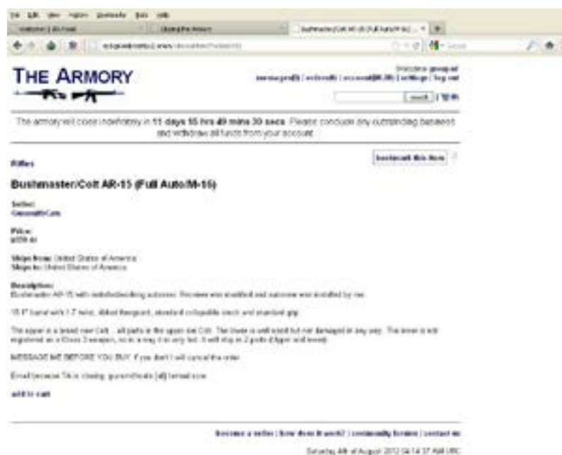
Figure II. Screenshot showing the page of a now defunct website created solely for the advertisement and sale of firearms