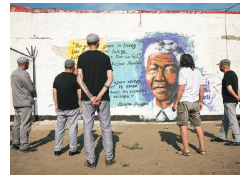
Embedding the Nelson Mandela Rules, Kazakhstan