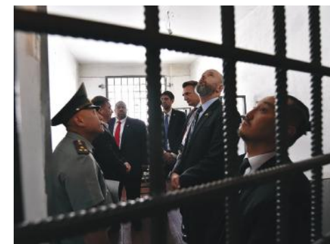
US Bureau of Counterterrorism visit to prison, Kyrgyzstan, 2022