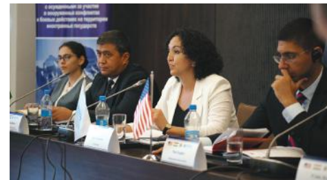
Project Steering Committee meeting, Tajikistan, 2023

The Academy committed to providing further training for prison and probation officers in Kyrgyzstan, demonstrating its dedication to the creation of a regional knowledge hub on preventing violent extremism in prisons, fostering long-term collaboration across the region, and the building of staff capacity. Its contribution played a critical role in laying the groundwork for sustainable program results. Participating countries committed to continued cooperation.