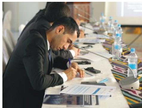
Risk and needs assessment training, Tajikistan, 2023