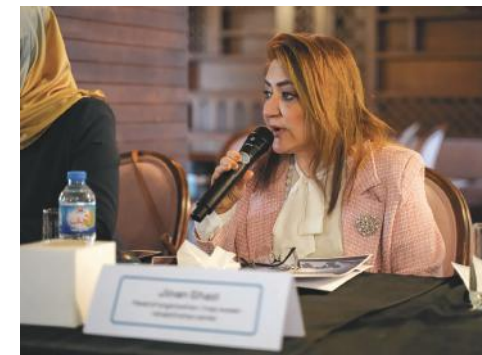
Meeting of civil society organizations, Iraq, 2022